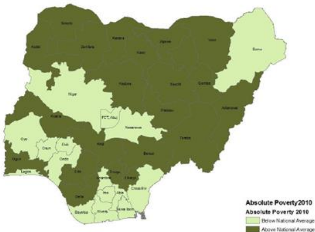
Figure 1: Map of Nigeria: Absolute Poverty Measure 2010 showing states above and below national average.

Ogwumike (2002) points that the number of those in poverty rose from 27% in 1980 to 46% in 1985; it decreased slightly to 42% in 1992, and increased sharply to 67% in 1996. By 1999 the estimated poverty was more than 70%, which compelled the federal government to intensify action on poverty reduction. Consequently, efforts have been made in all angles to reduce the level of poverty in Nigeria but greed has retarded positive efforts. Budgetary allocations have been on the increase, nevertheless, with no remarkable improvement. The National Bureau of Statistics said 60.9% of Nigerians in 2010 were living in "absolute poverty" - this figure had risen from 54.7% in 2004 (BBC News, 2012). (See Figure 1 for absolute poverty measure 2010 showing states above and below national average). Vanguard (2016) reported that no fewer than 112million Nigerians now live below poverty level as global poor hits one billion mark. According to the latest poverty report by the National Bureau of Statistics, NBS, about 112 million Nigerians (representing 67.1 per cent) of the country's total population of 167million (Vanguard, 2016).